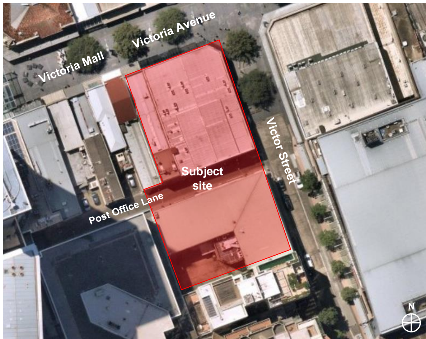
Figure 2: Subject site